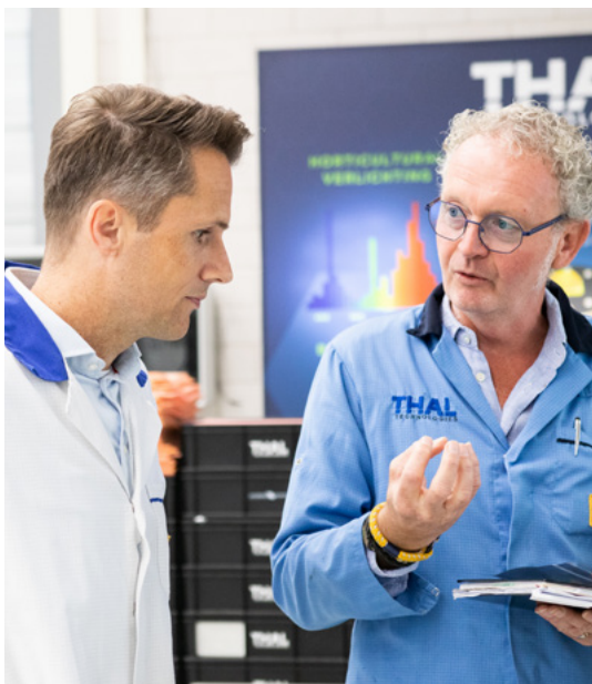
RAIL 1435 ON SITE VISIT AT THAL TECHNOLOGIES

Eventually, the Gyro Gearlooses of railways walked into Thal Technologies. Although the sensor of Rail 1435 may be slightly different from the high-tech industrial LED modules that Thal specialises in, Thal has several rail-related customers and the development and production of this product fits in well with what Thal has focused on; developing high-end electronic products that will function under all circumstances. The sensor is therefore used under very heavy and challenging conditions and must always function without problems. “In addition, we can turn to them for smaller series such as prototypes. They are very flexible at Thal, so they understand that sometimes you have to start small in order to end up big.”